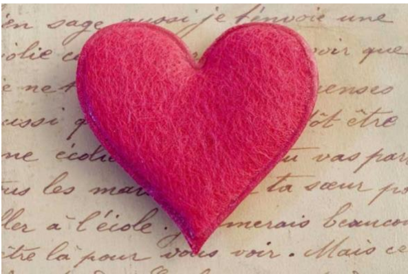
LOVE OF READING: Students at Nunthorpe Academy have been falling in love with literacy.